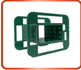
GLASS EPOXY G11 BOBBIN