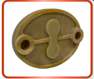
GLASS EPOXY FR4