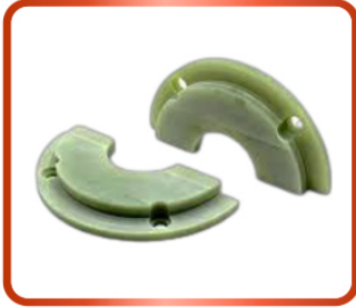
GLASS EPOXY FR5